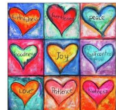
The Fruits of the Spirit